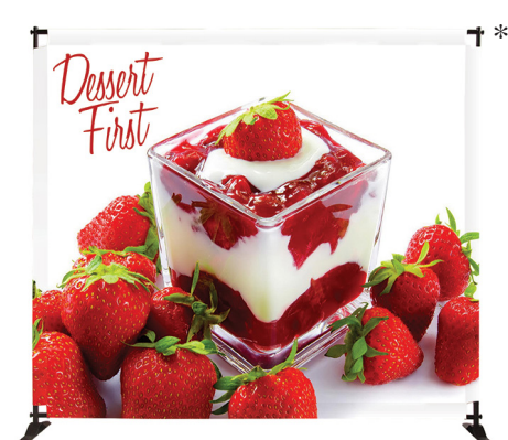
*Shown with optional finishing. Extra pole pockets added to left and right sides of graphic.